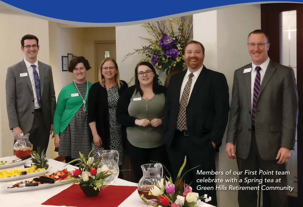
Members of our First Point team celebrate with a Spring tea at Green Hills Retirement Community