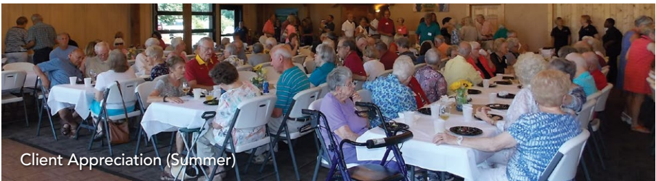
Client Appreciation (Summer)