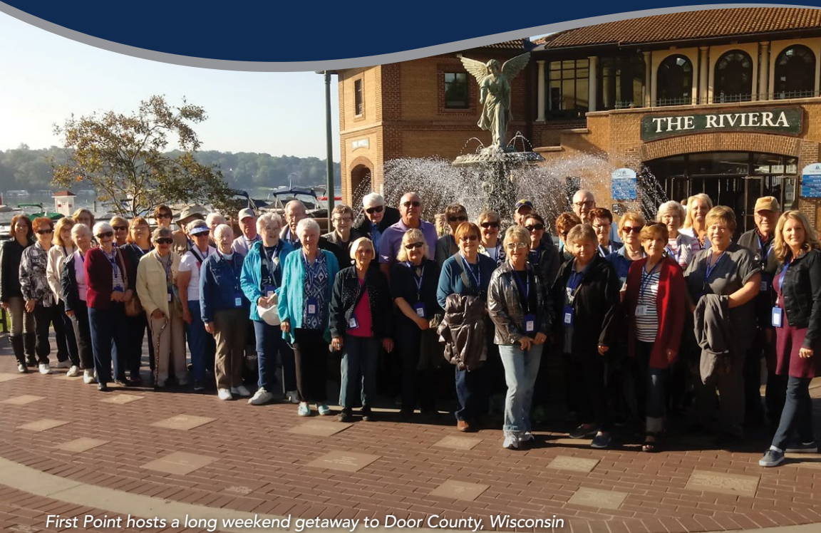
First Point hosts a long weekend getaway to Door County, Wisconsin