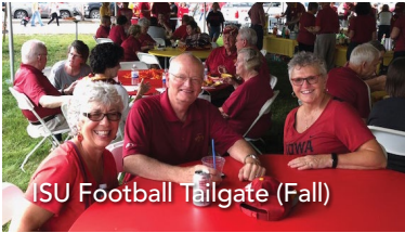
ISU Football Tailgate (Fall)

In 2018, we had over 1,000 clients attend our First Point events. We look forward to many more in 2019.