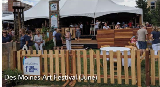
Des Moines Art Festival (June)