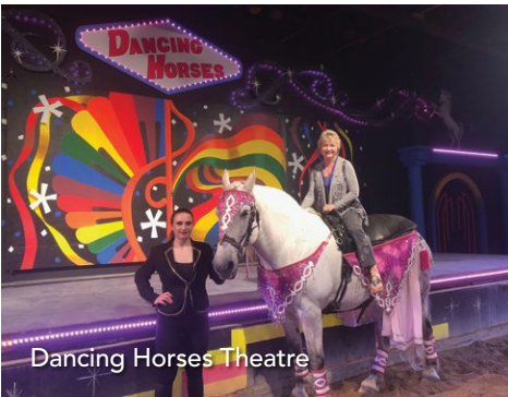
Dancing Horses Theatre