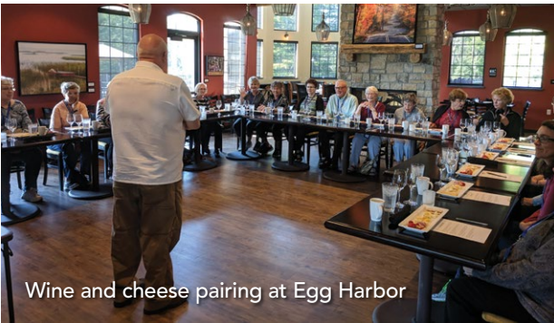
Wine and cheese pairing at Egg Harbor