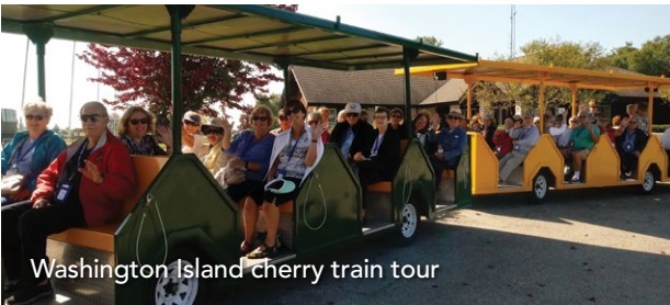
Washington Island cherry train tour