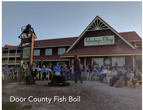
Door County Fish Boil