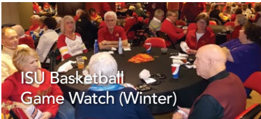
ISU Basketball Game Watch (Winter)