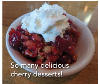
So many delicious cherry desserts!