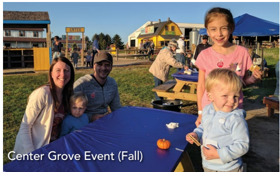
Center Grove Event (Fall)