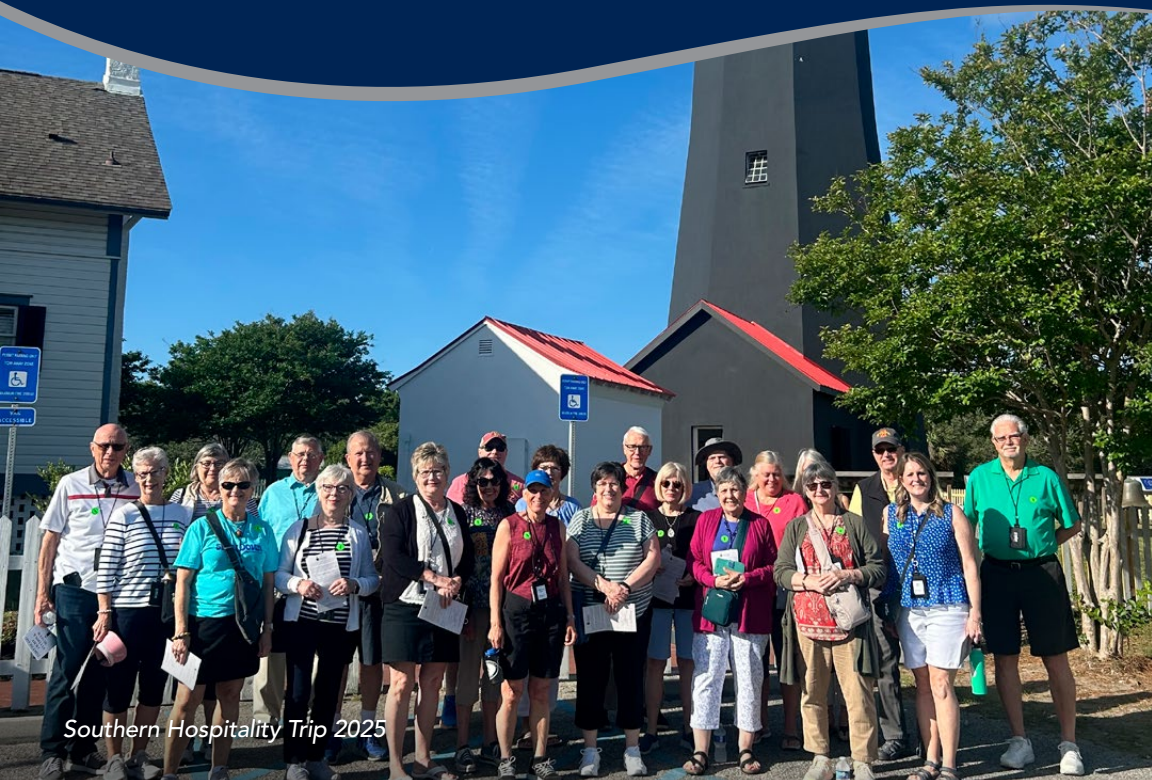
Southern Hospitality Trip 2025