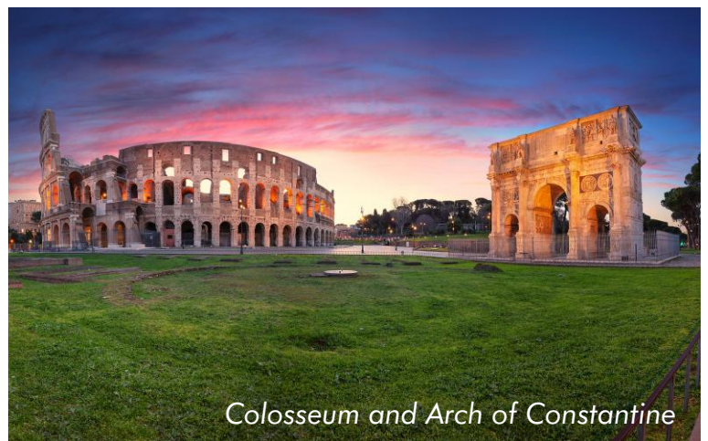
Colosseum and Arch of Constantine