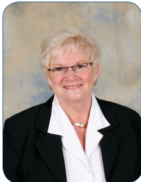
Northcrest Retirement Community