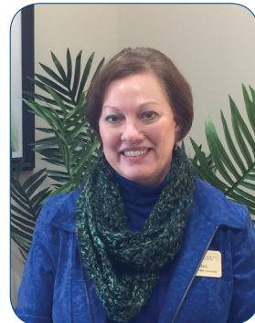
Green Hills Retirement Community